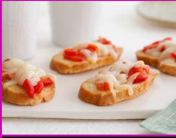
Sweet Pepper & Gorgonzola Crostini