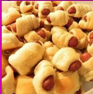
Polish Sausage Kabobs