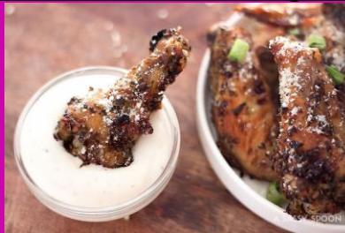
Crispy Chicken Dippers with Creamy Dill Pickle Sauce