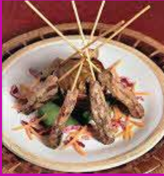
Beef Skewers with Hot Curry Mustard