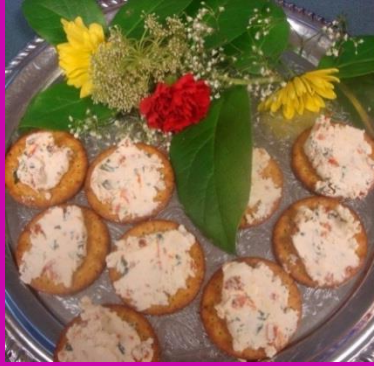
Creative Crab Balls