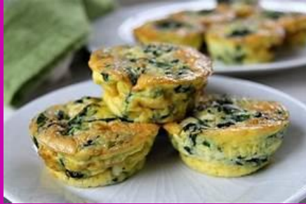
Spinach & Feta Mini Calzones