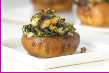
Spinach & Artichoke Party Cups