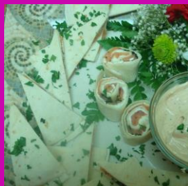
Waffle Iron Salmon Quesadillas