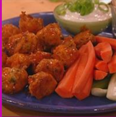
Buffalo Chicken Wings