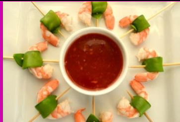
Spicy Shrimp with Remoulade Sauce